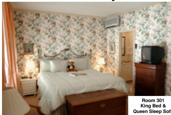
Room 301 King Bed & Queen Sleep Sofa