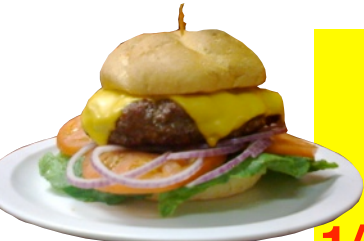
Colossal 1 lb

Topping prices are double on Colossal Burgers