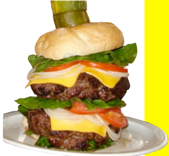
Super Colossal 2 lb