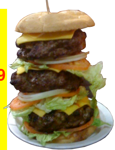
Super Duper Colossal 3 lb