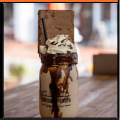
TURN THAT FROWNIE UPSIDE DOWNIE BROWNIE

DONUT WORRY, BE HAPPY Strawberry shake, vanilla icing rim dipped in rainbow sprinkles, topped with a rainbow sprinkle donut and whipped cream