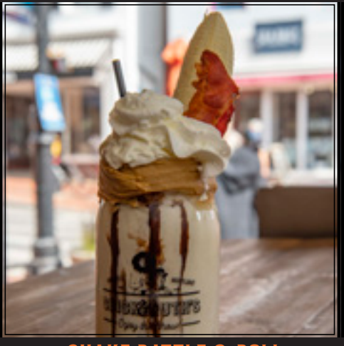
SHAKE RATTLE & ROLL

Chocolate shake. chocolate icing rim, topped with a chocolate brownie and whipped cream, chocolate