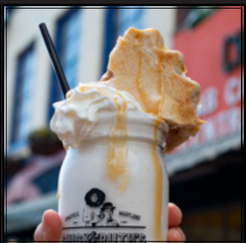
APPLE PIE SHAKE

chocolate iced rim, topped with Black & White cookie, whip cream, and chocolate drizzle